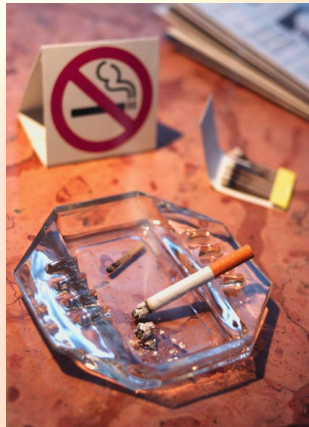
Shannon Rios Communications Committee Staff Council Secretary

“Smoking will not be permitted in any University-owned or leased buildings or vehicles, indoor facility, or indoor site at The University of Texas at San Antonio (UTSA), except in areas permitted. Smoking is permitted outside any building as long as it is 20 feet or more from the entryway, doorway, or common path of travel, with one exception. At the Recreation and Wellness Center, the permissible smoking distance is 100 feet from any outside entrance or doorway. Violations will be dealt with on a case-by-case basis in accordance with established disciplinary policies of the University.”