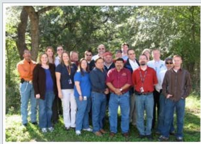
UTSA's Environmental Health, Safety and Risk Management Team. Successful Solutions Start with Safety.

"On-campus student housing" consists of four developments. The UTSA Housing and Residential Life department (HRL, http://www.utsa.edu/housing/ ) operates two of these, Chaparral Village and Laurel Village. Campus Living Villages (CLV, http://www.campushousing.com/utsa/ ) operates two of these, Chisholm Hall and University Oaks apartments.