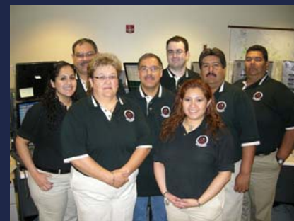
The UTSA Police Department. Protecting Your Future...Today.

In addition to registering an emergency contact, students residing in on-campus housing have the option to select a confidential contact person to be contacted by UTSA in the event the student is determined to be missing for more than 24 hours. If a student has selected a confidential contact person, UTSA will notify that person no later than 24 hours after the student is determined to be missing. Students who wish to identify and select a confidential contact can do so through their respective on-campus housing management.